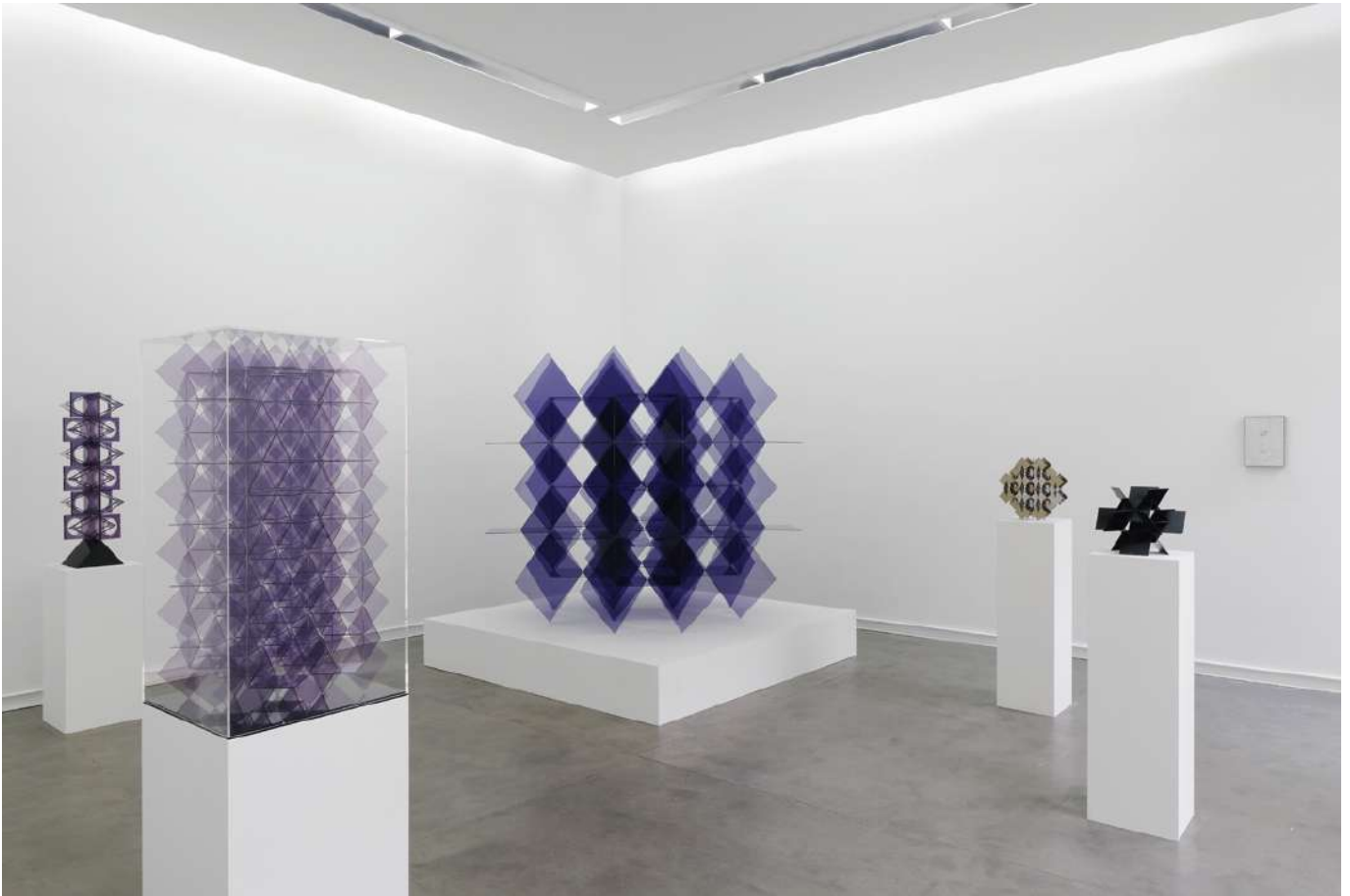
Vue de l'exposition Modus Operandi , Galerie Mitterrand, Paris, 2017 / Exhibition view, Modus Operandi , Galerie Mitterrand, Paris.

79 RUE DU TEMPLE 75003 PARIS - T +33 1 43 26 12 05 F +33 1 46 33 44 83 INFO@GALERIEMITTERRAND.COM WWW.GALERIEMITTERRAND.COM