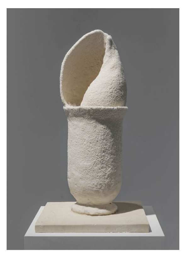
Michel Blazy, Vamos a la playa, 2017

Épreuve numérique monté sur aluminium 159,5 × 131,5 × 5 cm Inv. FNAC 2000-680. Centre national des arts plastiques © Adagp, Paris 2021