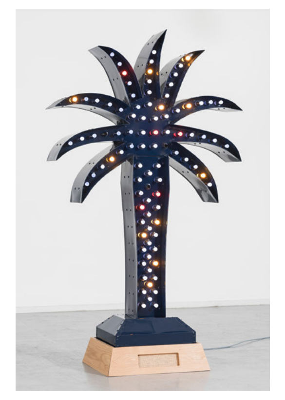
Yto Barrada, Green palm, 2016