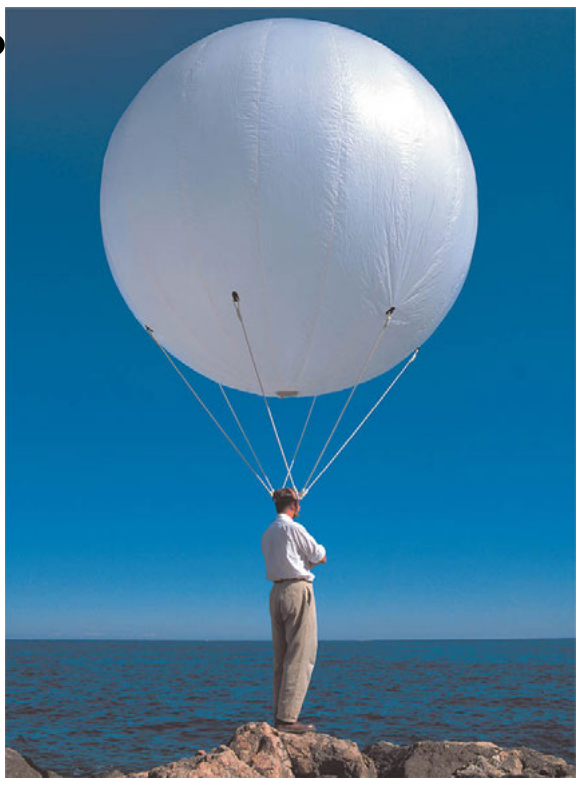
Philippe Ramette, Sans titre (Éloge de la Paresse), 2000 Photographie couleur

Épreuve numérique monté sur aluminium 159,5 × 131,5 × 5 cm Inv. FNAC 2000-680. Centre national des arts plastiques © Adagp, Paris 2021