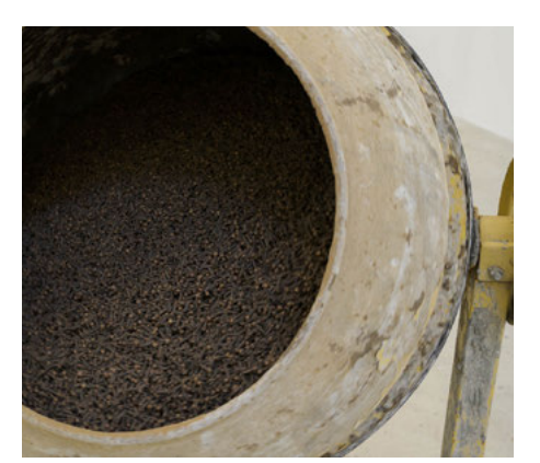
Kader Attia, Parfum d'exil , 2018 Bétonnière, clous de girofle Courtesy de l'artiste et galleria Continua, Italie © photo droits réservés © Adagp, Paris 2021