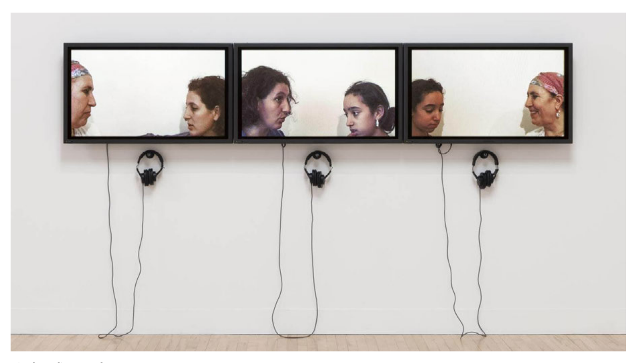
Zineb Sedira, Mother Tongue, 2002 AM 2006-74 Centre Pompidou, Paris Musée national d'art moderne /Centre de création industrielle © photo droits réservés © Adagp, Paris 2021

Courtesy de l'artiste et galerie Michel Rein, Paris/Brussels © photo droits réservés © Adagp, Paris 2021